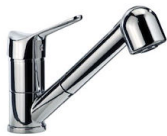
Mixer Tap S1000 - Z65 8449 500